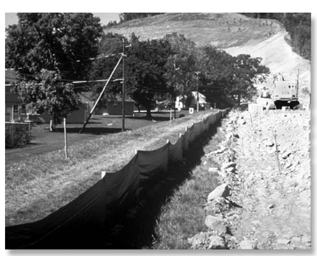
A silt fence is an effective practice for controlling construction site erosion/sedimentation if properly installed and maintained.

NOI, and to send the SWPPP and NOI to the local governing authority. DEC can decide to review any SWPPP; developers must make plan documents available to the department for review upon request. The department will require the applicant to revise any SWPPP that does not conform with state standards. DEC's review power provides a backstop for local reviewers, with the ability to impose greater penalties.