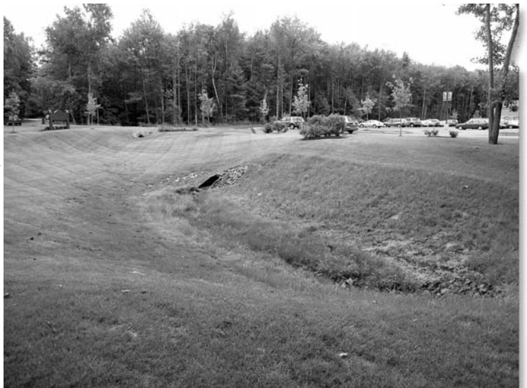
This infiltration basin handles the stormwater from a large parking lot, catching pollutants as the water seeps into the soil. This practice replenishes local groundwater, rather than allowing stormwater to be lost. Integrated into the landscaping, the basin adds to the appeal of the property.

Minimum Control Measure 3—Illicit Discharge Detection and Elimination: Regulated MS4s must establish plans to detect and eliminate illicit discharges (discharges not composed entirely of stormwater) to the storm sewer system. They must map all outfalls from the storm sewer system to surface waters (not only from pipes, but also from road ditches, swales and other stormwater carriers), and must inform public employees and the community about the hazards of illegal discharges and improper waste disposal. Illicit discharges to the storm sewer system must be prohibited by ordinance or regulation, and the prohibition must be enforced.